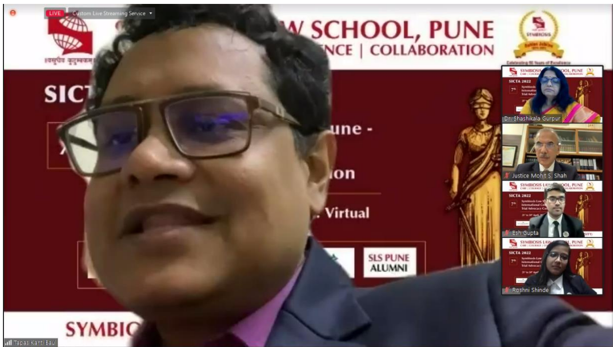
Guest of Honour Tapas Kanti Baul, Prosecutor, International Crimes Tribunal, Bangladesh