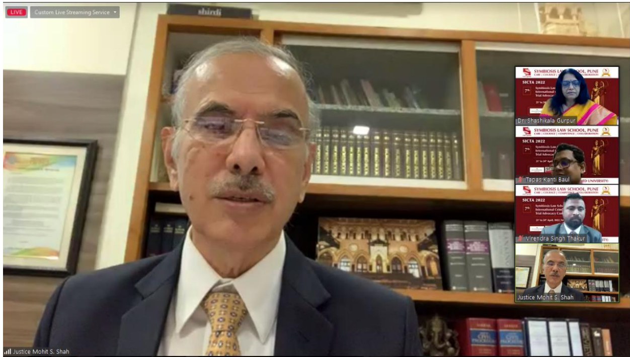
Chief Guest Hon'ble Justice Mohit Shah, Former Chief Justice, Bombay High Court