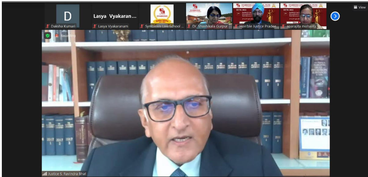
Chief Guest, Hon'ble Justice Ravindra Bhat, Judge, Supreme Court of India addressing the audience